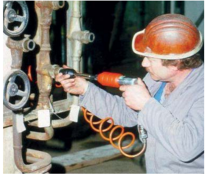
KVS grinding on-site

unigrind KVS 369/150K grinding machine with 3-jaw-chuck