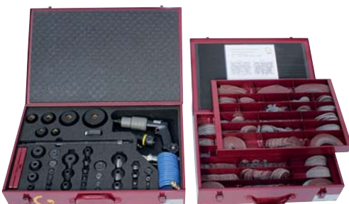
KVS 369/65 Transport box with grinding tools and with abrasive set

Other combination of angles or additional angles are available on customer request. Also slight changes in the working range are possible. Tool holders for working depth extension.