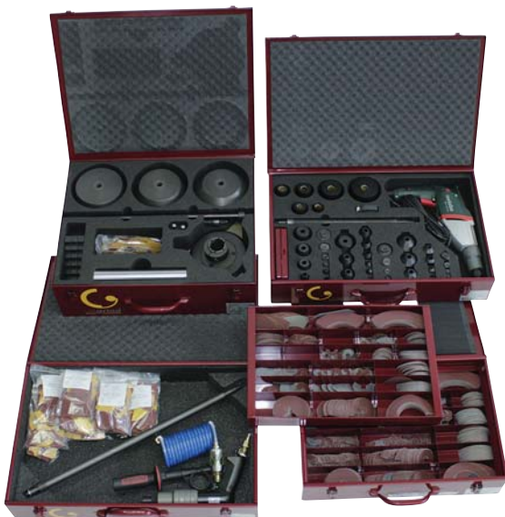
KVS 369/150K Transport box with grinding tools and abrasive set

For the big sizes DN 6"–12" and the very deep valves we recommend to use the machine arm with upper gear housing and internal spring loaded grinding spindle.