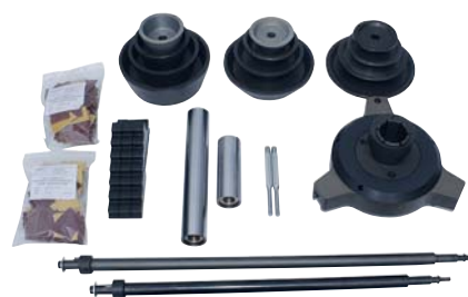
KVS Grinding tools, range DN 80–150 (3"–6")