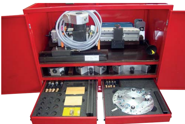
FD transport container with accessories