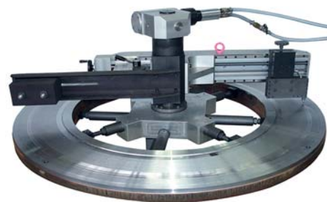
Sample of application