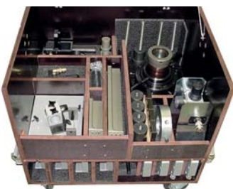
HTS transport container with accessories