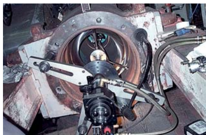
HTS 400 grinding on-site