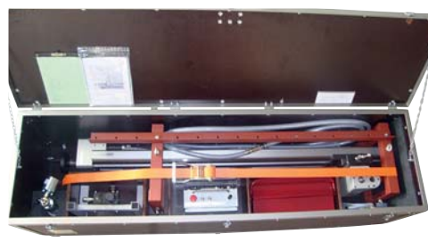
MFM-2 Transport box with accessories